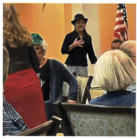
Fantastic Show, Superb Dinner, Great Night Out!! The event was Excellent!