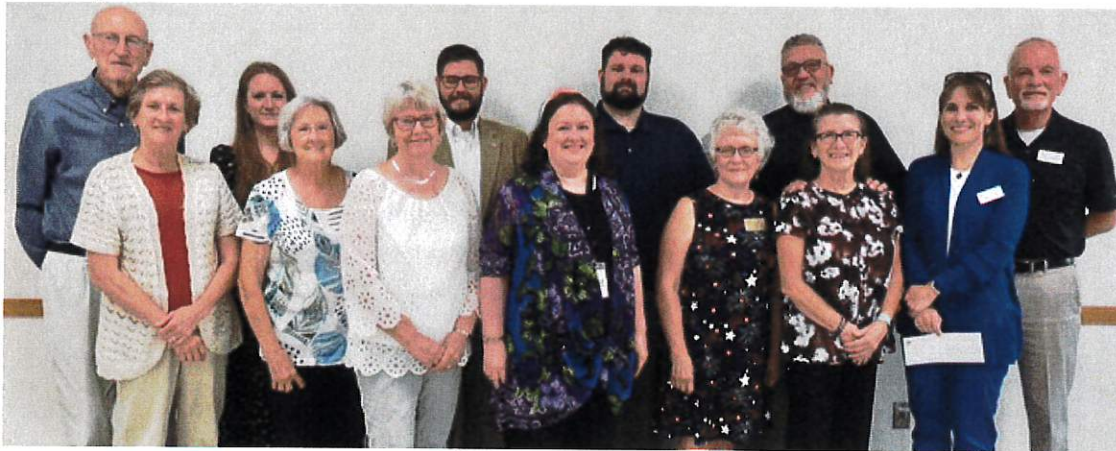
Recipients of the Scottish Rite Grants: HERO, Friendly House, Quilts of Valor, Illowa Council BSA, Hope at the Brick House, Durant-Wilton Food Pantry, St Ambrose University, and Iowa Masonic Health Facility. Also receiving grants, but not pictured, are the Food Bank of Iowa, First Tee of the Quad Cities, Alzheimer's Iowa Chapter, and Center for Active Seniors (CASI)